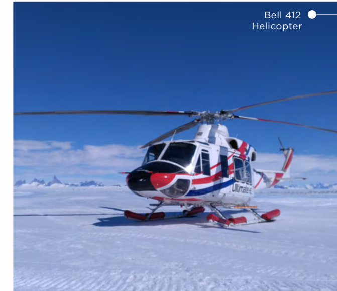
Bell 412 Helicopter

Once in Antarctica, we have two DC3 Basler planes that are equipped with skis to land on snow. Depending on dates, we also have access to helicopters, while our ground teams use specially modified 6x6 vehicles to transport you on the ground.