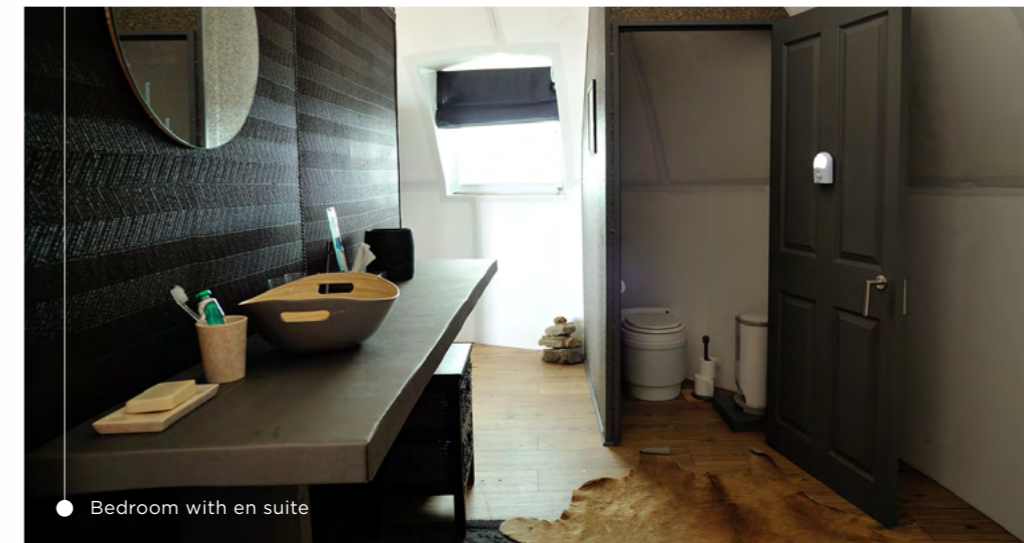
Bedroom with en suite

"Whichaway Camp offers the perfect balance between polar functionality and luxury camp comfort." Rick Garratt, CEO, Home Choice