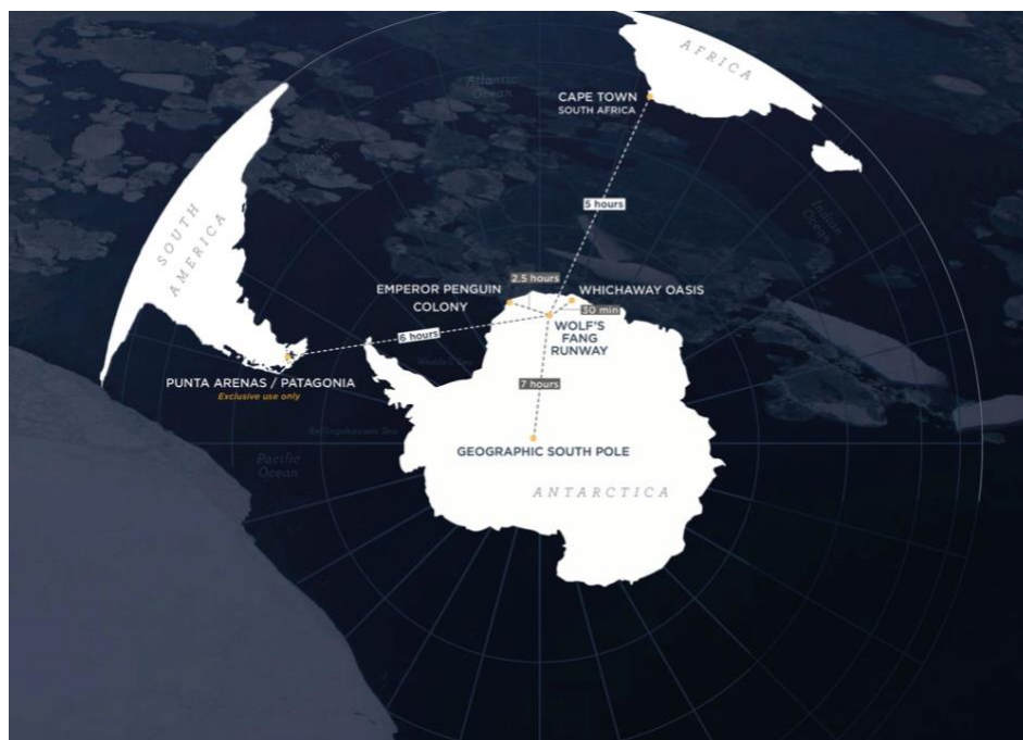
Figure 1: Guest Itinerary

The vast majority of our tourists return from Antarctica as members of our Antarctica Ambassadors Programme, which supports conservation efforts for the Continent’s conservation. Furthermore, by using our aircraft to deliver scientists to their stations, we assist in vital, on-going climate change research.