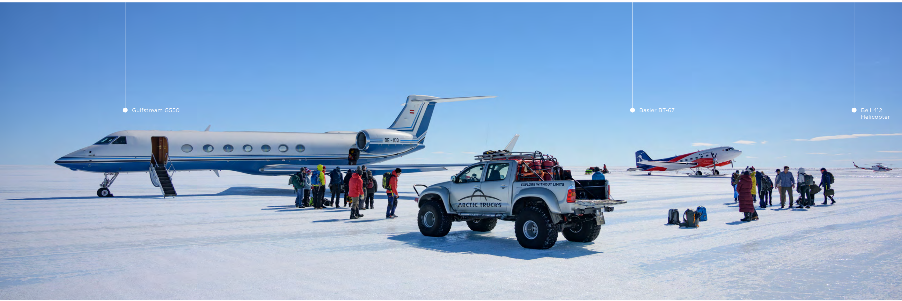
● Bell 412 Helicopter