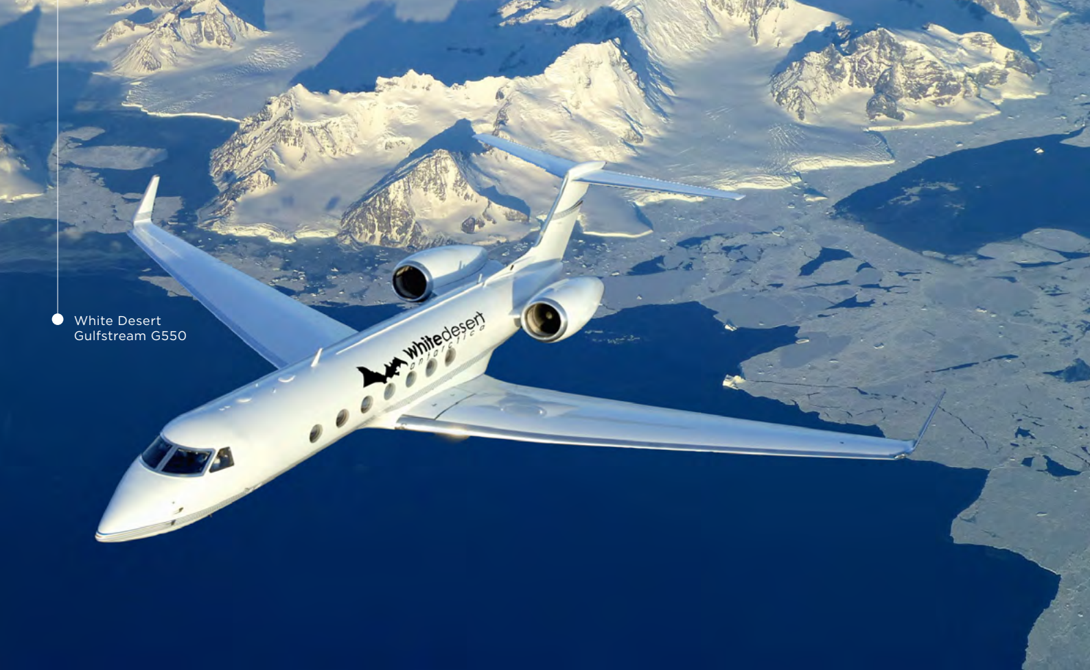
White Desert Gulfstream G550