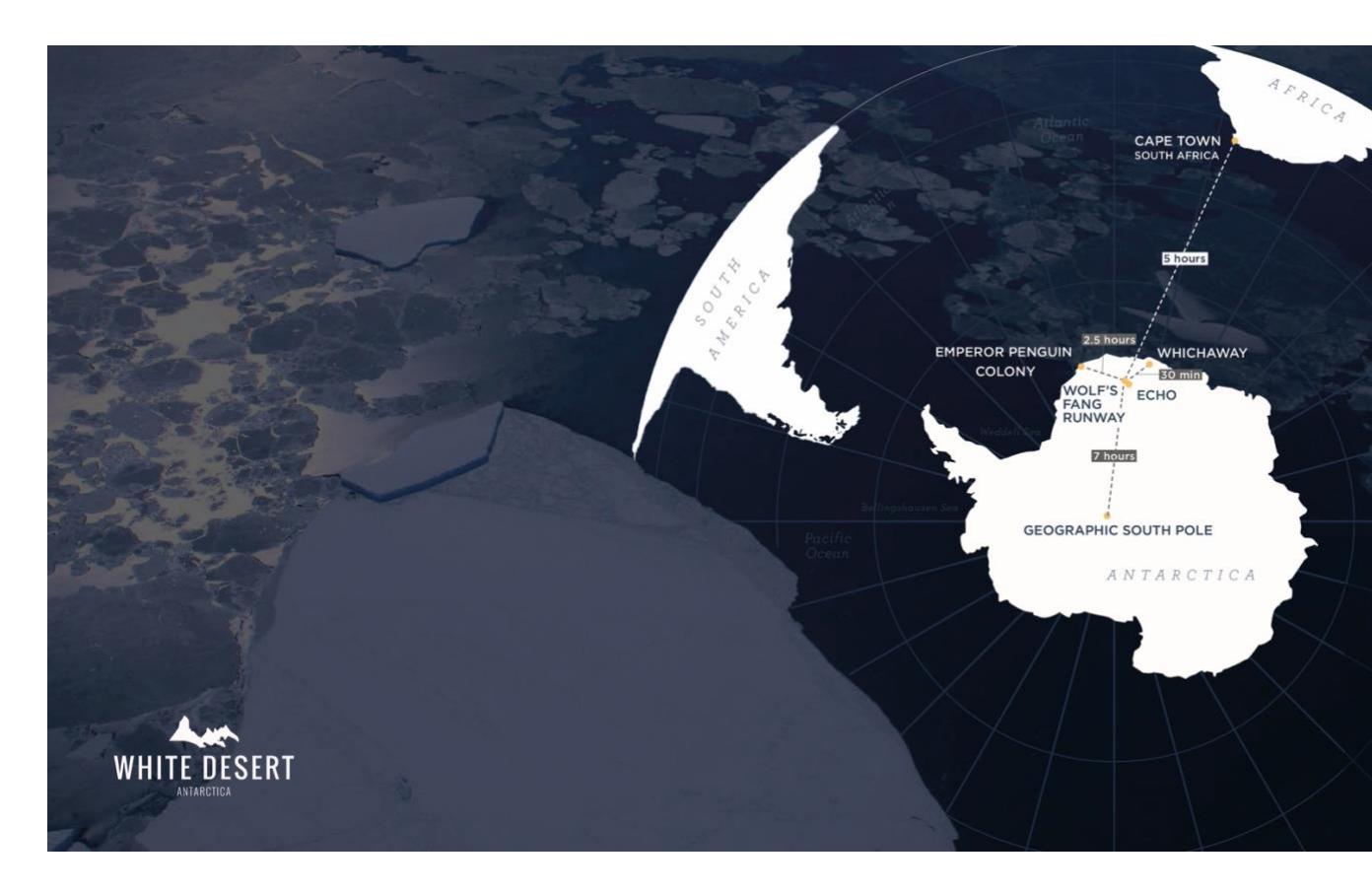
Figure 2: Guest Itinerary – South Pole + Emperors