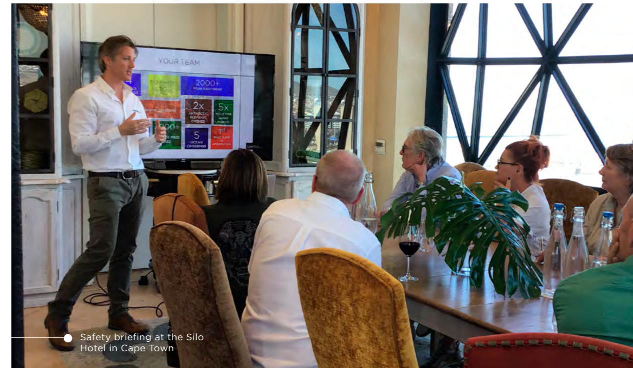
● Safety briefing at the Silo Hotel in Cape Town

Antarctic travel is the only thing White Desert does. It's our passion, it's our mission and it's in our DNA.