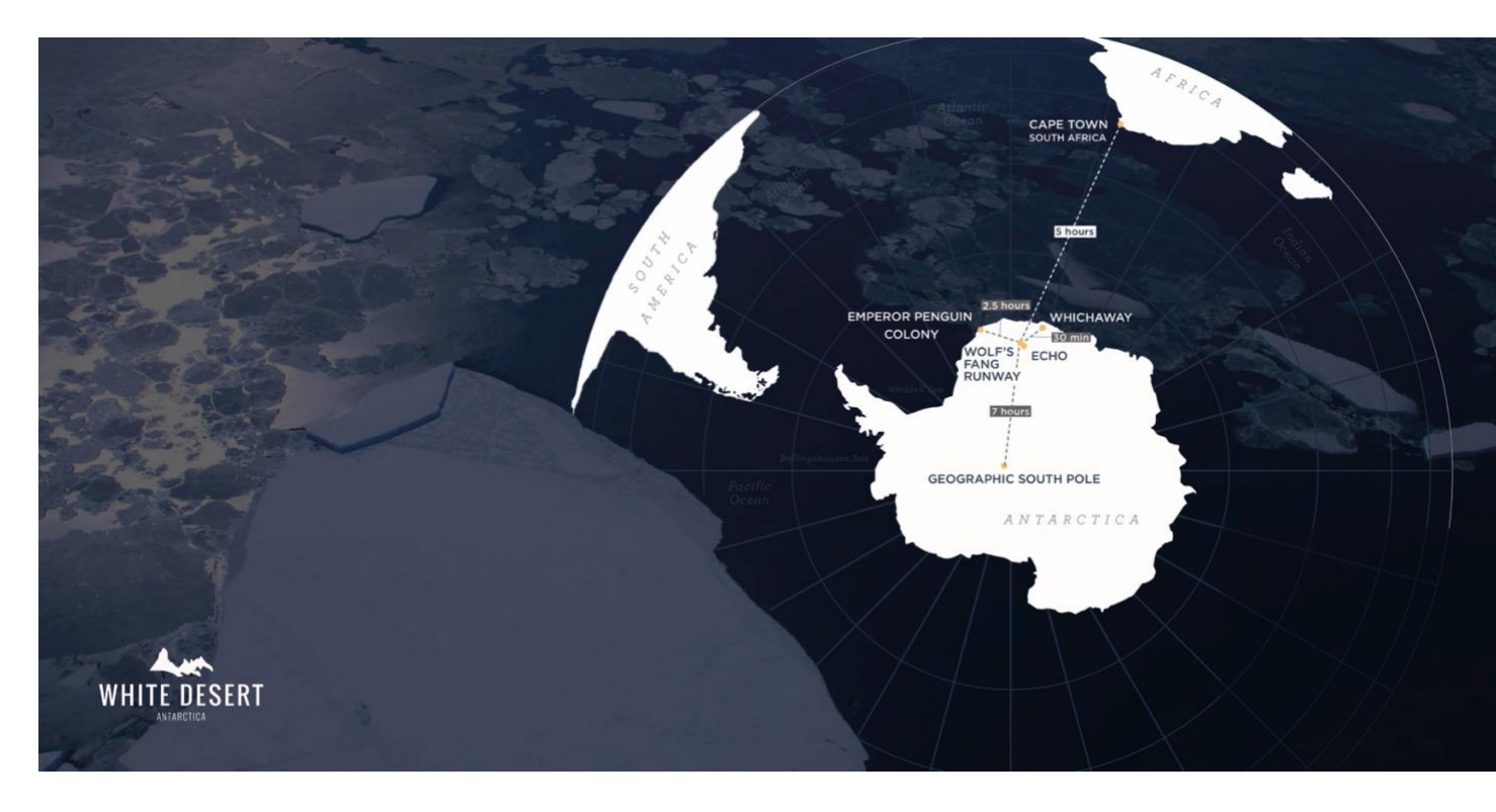
Figure 2: Guest Itinerary - South Pole + Emperors