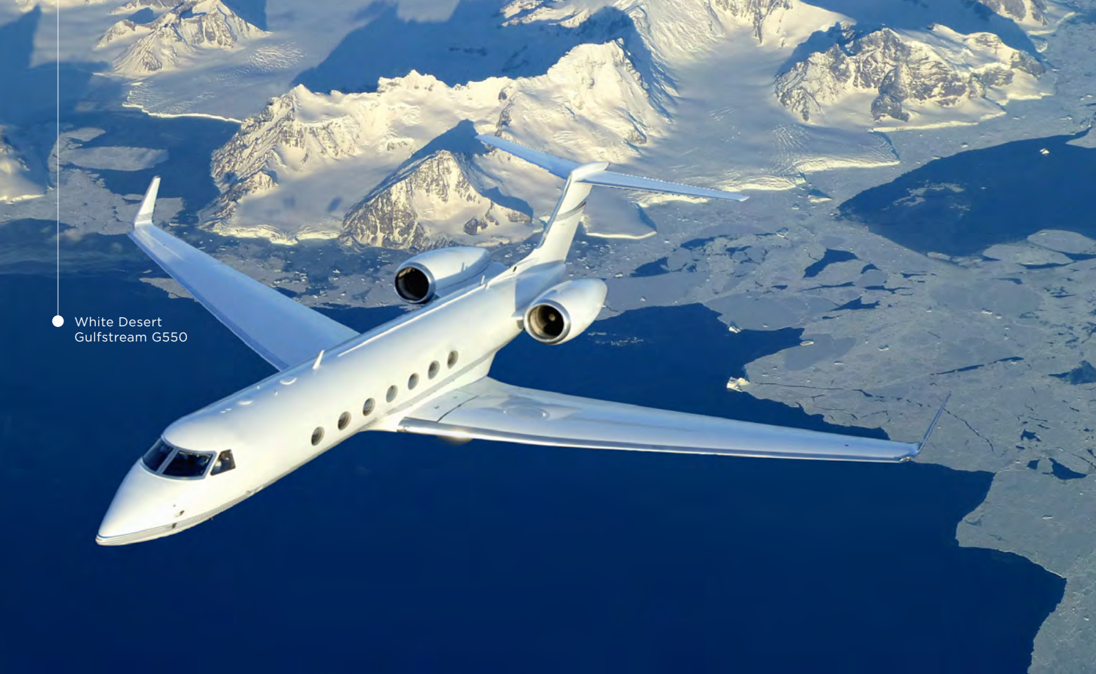
White Desert Gulfstream G550