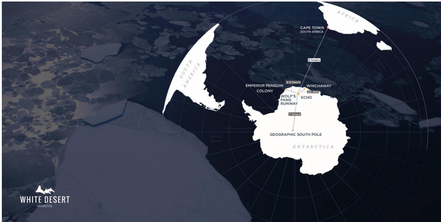
Figure 2: Guest Itinerary – South Pole + Emperors