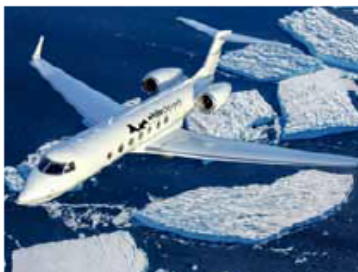
A song of ice and flier

Described as Antarctica's first and only luxury camp, White Desert Antarctica offers an eight-day 'Emperor and Penguins' trip, a four-day 'Ice and Mountains' trip, and, for the time-poor UHNW, a one-day private chartered trip called 'Great Day'. The maximum number of guests on each trip is 12. Earlier this year, the camp launched its own private jet service (strictly carbon-neutral, needless to say) flying guests out by Gulfstream from Cape Town, South Africa. You will land on a blue ice runway in front of the majestic Wolf's Fang peak, watch Emperor Penguins and their newly hatched chicks in a 6,000-strong colony, and visit the US science station at the South Pole. An eight-day trip in December 2018 will set you back $80,000 per person: but better hurry up, because three of their seven 'Emperor and Penguins' trips for the 2018-19 season are fully booked already.