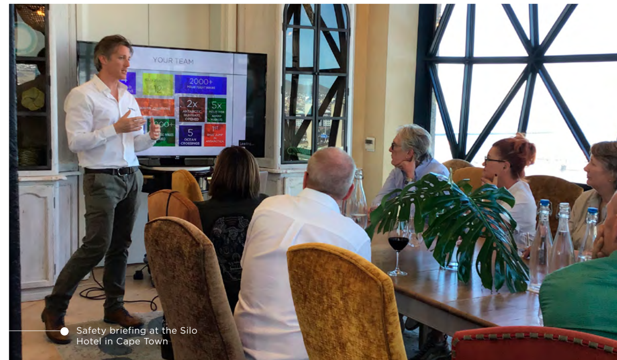
● Safety briefing at the Silo Hotel in Cape Town

Antarctic travel is the only thing White Desert does. It's our passion, it's our mission and it's in our DNA.