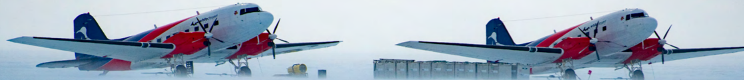
Baslers BT-67 ●