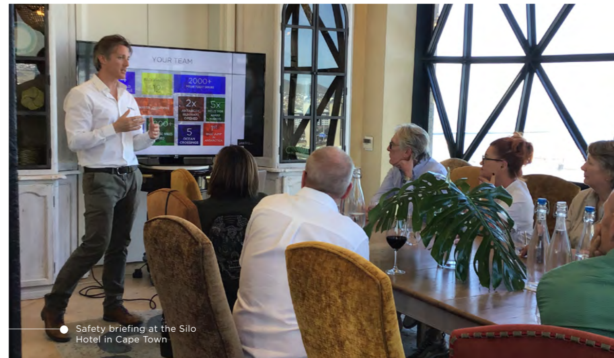
● Safety briefing at the Silo Hotel in Cape Town

Antarctic travel is the only thing White Desert does. It's our passion, it's our mission and it's in our DNA.