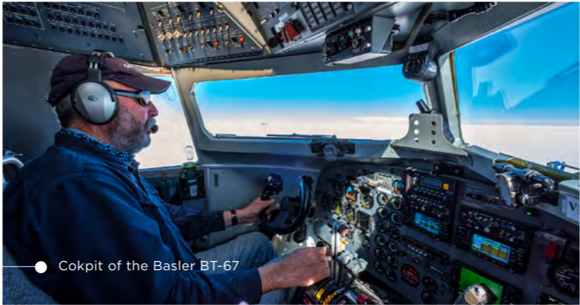
Cockpit of the Basler BT-67

As part of our responsibility towards conserving Antarctica, all emissions from our operations, including all flights to, from and within the continent, are offset by fully-accredited carbon-neutral schemes.