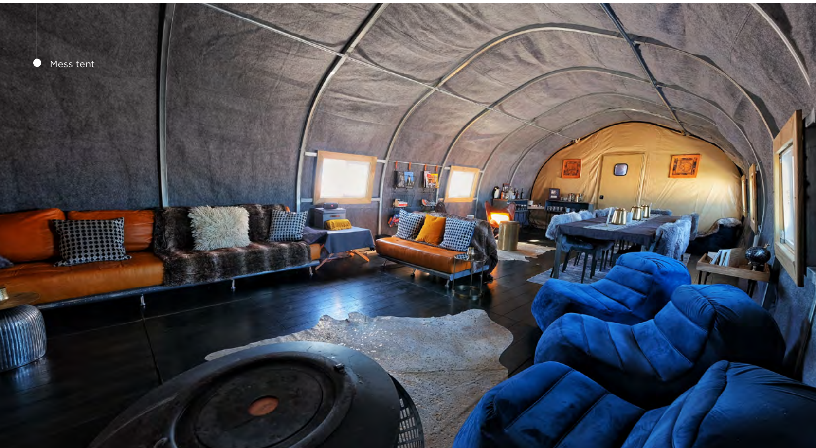
● Mess tent

Wolf's Fang is made up of 6 guest sleeping tents, a large communal tent and a newly refurbished washroom facility. All guest areas are heated for your comfort.