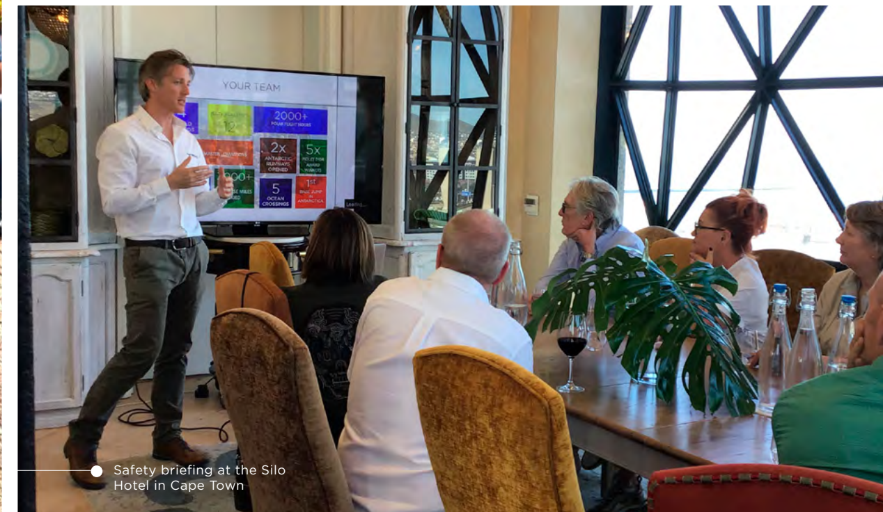
● Safety briefing at the Silo Hotel in Cape Town

Antarctic travel is the only thing White Desert does. It's our passion, it's our mission and it's in our DNA.