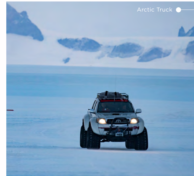
Arctic Truck ●