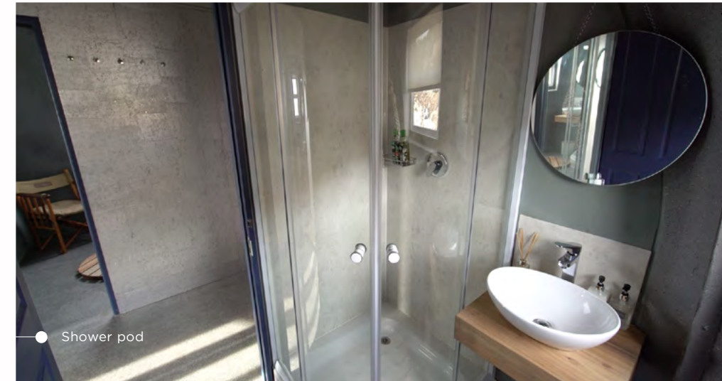
● Shower pod

Our camp consists of seven heated and state-of-the-art bedroom pods that are designed for two guests in each. At just over 6m (20ft) in diameter, you'll find they are also spacious, with a writing desk, wash area and toilet.