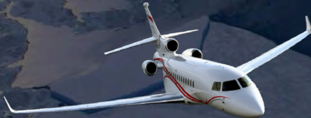
DASSAULT FALCON 7X