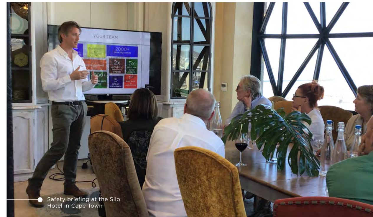
● Safety briefing at the Silo Hotel in Cape Town

Antarctic travel is the only thing White Desert does. It's our passion, it's our mission and it's in our DNA.