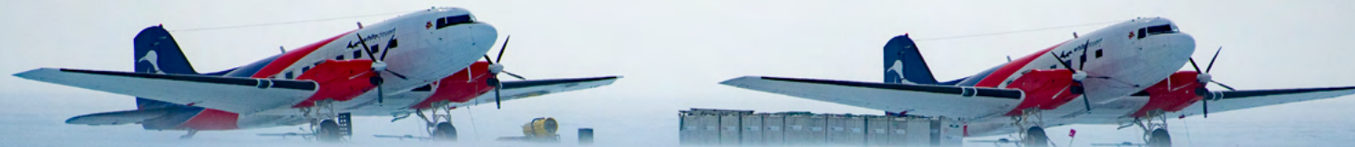
Baslers BT-67 ●