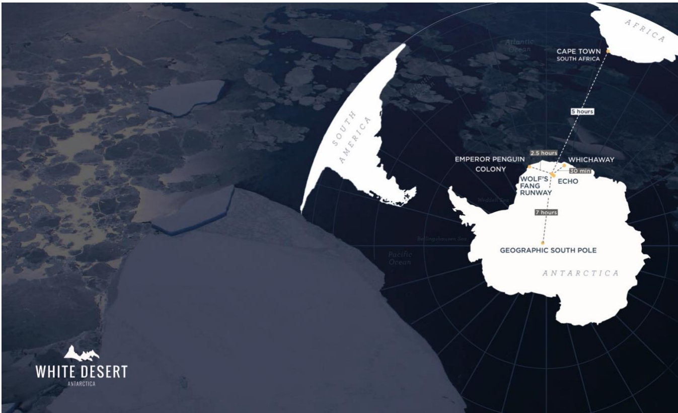
Figure 2: Guest Itinerary – South Pole + Emperors