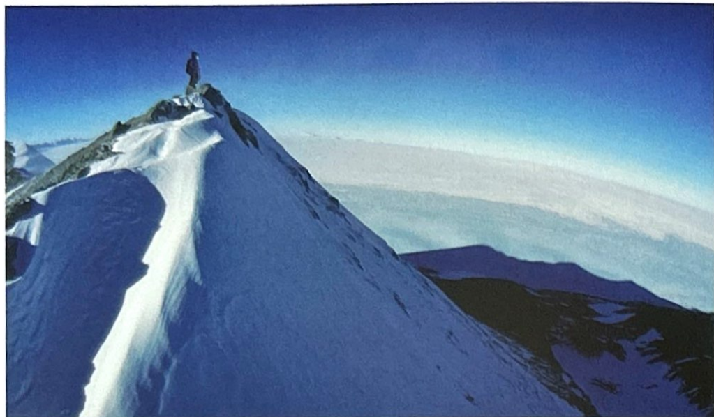
ABOVE: The entire trip across the region is packed with humbling sights

lunch we continue deeper into the continent, hiking for hours around lichen-covered scree until we reach a cliff overlooking the edge of the ice shelf, whose frozen waves extend beyond the scope of vision. We descend the slope and search for an entrance into the solid ice, a door into a breathable sea. A tunnel reveals itself, and we are ensconced in a cobalt blue so sharp, so dense, that I no longer believe I've truly experienced the colour blue until now.