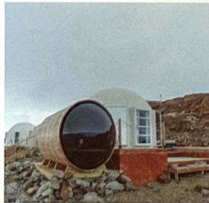
CLOCKWISE FROM TOP LEFT: Guests prepare to board; the Basler BT-67 aircraft on skis at Wolf's Fang Runway; pod at Whichaway camp