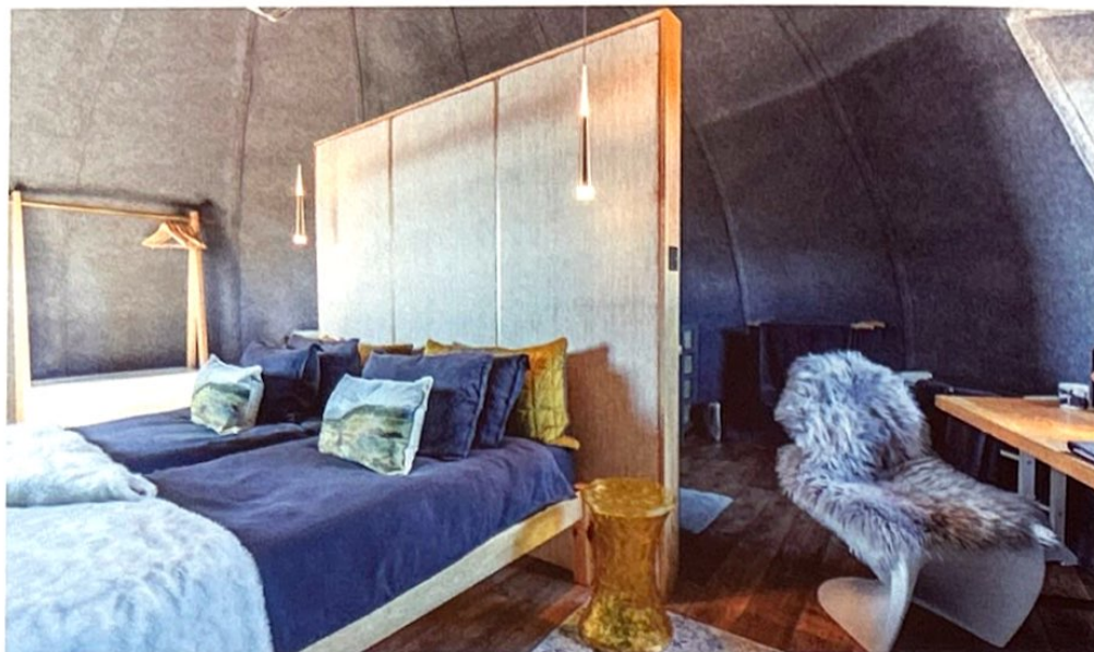
ABOVE: Glamping-style accommodation at White Desert camp Whichaway

lake in front of a looming glacier. We're on the Schirmacher Oasis, an ice-free exception to the continent's nearly 98% coverage. It's still very, very cold. After a brief tour of the facilities, including how to use the glamping-style toilets (waste is shipped off the continent at the end of the season), I snuggle beneath the dense blankets and faux fur throw adorning my cosy bed.