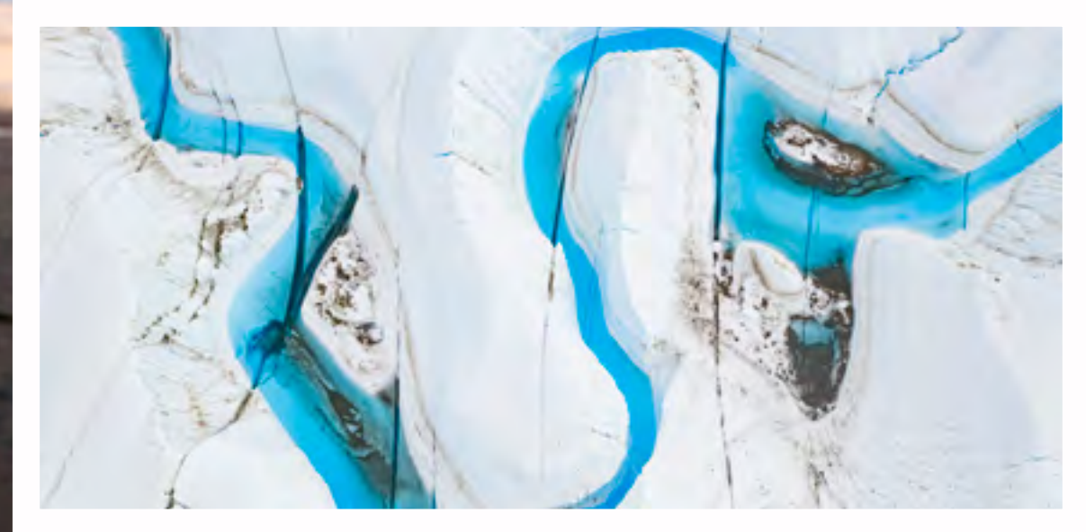
Waste management - We keep waste to a minimum by repackaging all consumables before we bring them to Antarctica, while at the end of the season, all solid waste is shipped back to South Africa for recycling or responsible disposal.