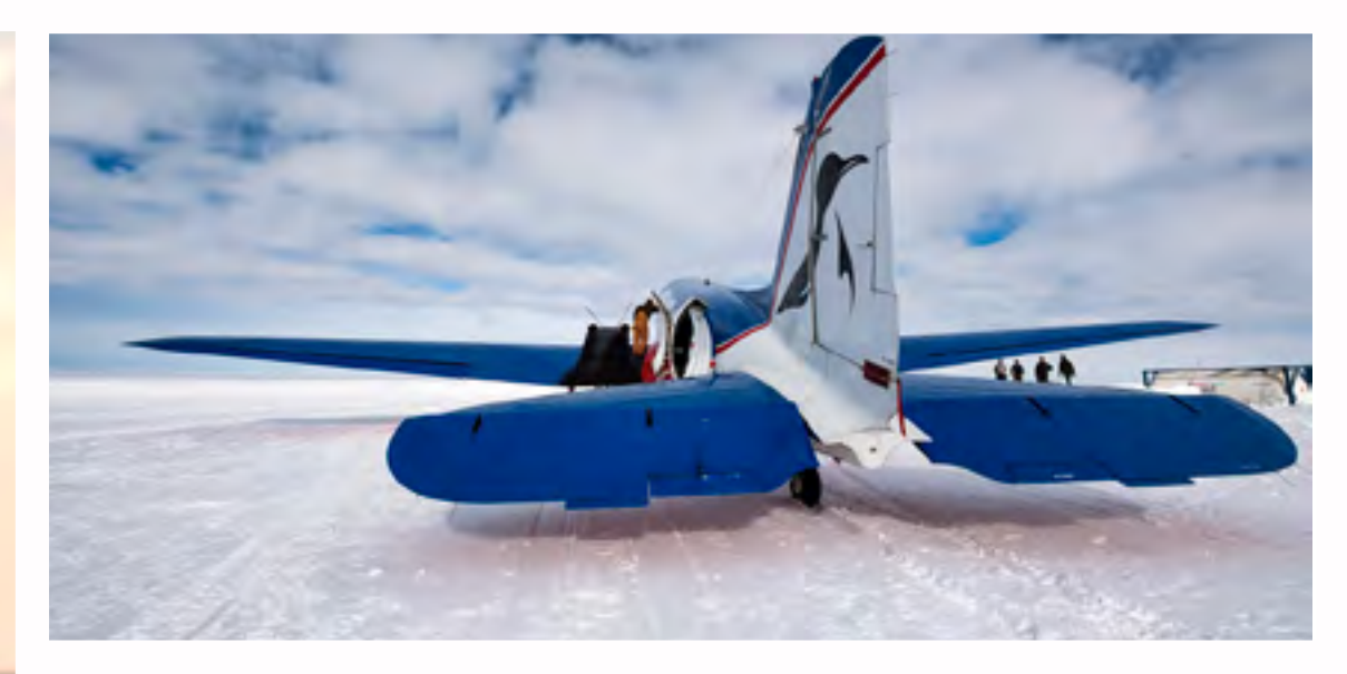
Carbon neutral - White Desert was the first aviation operator in Antarctica to be entirely Carbon Neutral, a status the company has held since 2007.